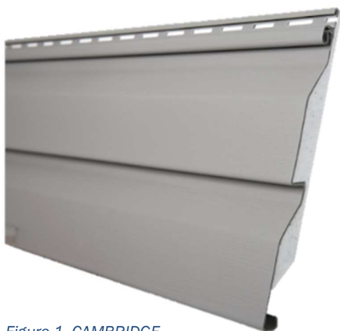
Figure 1- CAMBRIDGE PROFILE

This profile is also known in the New Zealand market as “RUSTICATED” and “SENTRY” – Rusticated is the texture of finish where an embossed woodgrain pattern is visible, whereas Sentry is a brush texture finish and available in a dark colour range.