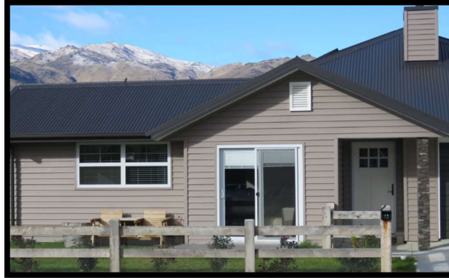
Figure 2 -CEDARLINE