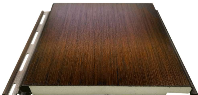
Figure 5 – WEST RIDGE S8

This profile is known in the New Zealand market as “WEST RIDGE”. The profile look makes it most popular for vertical accenting, horizontal and even 45-degree cladding situations. The PVC skin is heavy gauge and comes in a range of variegated colours and textures. A modern sleek looking profile with superior long lasting maintenance free qualities carrying a 50-year integrity warranty.