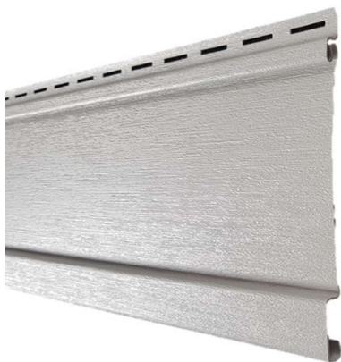
Figure 4 – Board and Batten

This profile is also known in the New Zealand market as “Board and Batten”. The profile look makes it most popular for vertical accenting and full cladding situations. The finish texture is a heavy brushed woodgrain, and it comes in a range of standard colours and special Sentry dark colours.