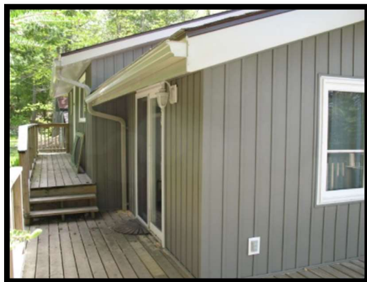
Board & Batten