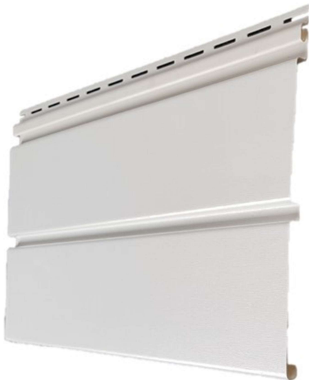
Figure 3 -Vertical D5/Soffit

This profile is also known in the New Zealand market as “Soffit”. The profile look makes it most suitable for soffit area and patio ceiling areas. The profile is also popular for use as vertical accenting, as full wall cladding, or gables ends. The finish texture is smooth, and it comes in a range of standard colours. The product is also available with a foam backing