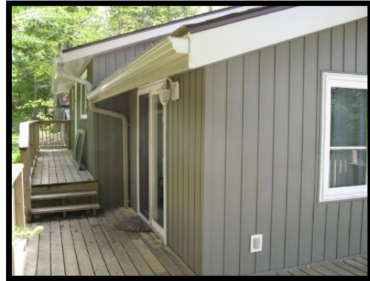
Board & Batten