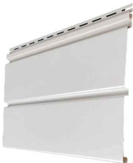
Figure 3 -Vertical D5/Soffit

This profile is also known in the New Zealand market as “Soffit”. The profile look makes it most suitable for soffit area and patio ceiling areas. The profile look makes it most suitable for soffit area and patio ceiling areas. The profile is also popular for use as vertical accenting, as full wall cladding, or gables ends. The finish texture is smooth, and it comes in a range of standard colours. The product is also available with a foam backing