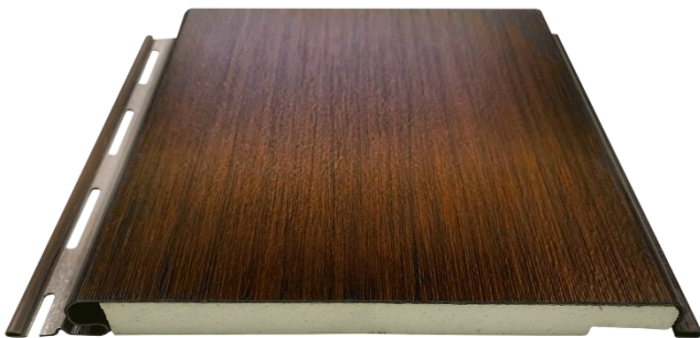
Figure 5 – WEST RIDGE S8

This profile is known in the New Zealand market as “WEST RIDGE”. The profile look makes it most popular for vertical accenting, horizontal and even 45-degree cladding situations. The PVC skin is heavy gauge and comes in a range of variegated colours and textures. A modern sleek looking profile with superior long lasting maintenance free qualities carrying a 50-year integrity warranty.