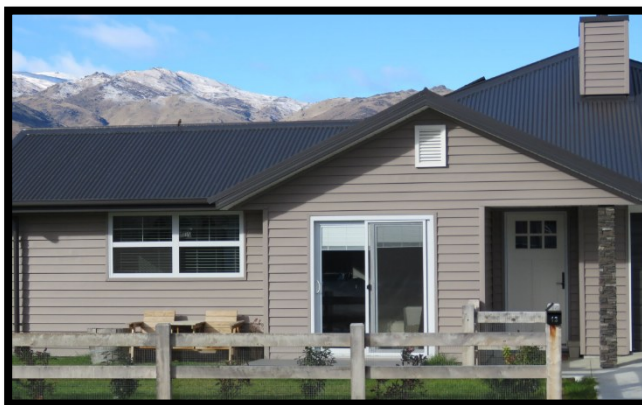
Figure 2 -CEDARLINE